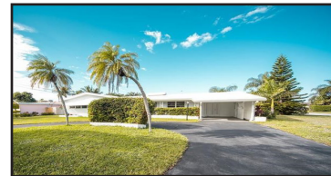
THE COVE Just Listed @ $439,000.

Wow! 9500+sq ft corner lot with 3 bedrooms, 2 baths feature kitchen cabinets, countertops, appliances, AC, water heater, washer/dryer and refinished terrazzo floors all only 4 years old. Huge walk in closets, ample storage, tons of natural light throughout. MLS F10154276