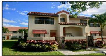
INDEPENDENCE BAY JUST LISTED @ $195,000.

This 2nd floor large corner unit 2/2 allows for privacy, more sq. footage and extra windows making it light and bright. Bonus room off family room can be used for den/office. Unique open kitchen, Attic has extra storage. Large screened balcony overlooks lush green space. MLS F10154404