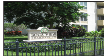
BOCA VIEW $285,000.

Enjoy beautiful Boca Raton year round in this resort style building just a short walk to the beach, local shops and restaurants. This spacious 2 bedroom/2 bathroom condo boasts 2 walk-in closets, open concept kitchen and pool view from the private balcony. MLS R10480876