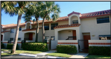
INDEPENDENCE BAY JUST REDUCED TO $174,000.

Desirable 2nd floor 2 br 2bth with stunning water views. Freshly painted, Vaulted ceilings, Tile in the living areas, screened in balcony. Guard gated community boasts 5 pools, tennis, clubhouse, child's play area, exercise room and so much more! MLS F10147906