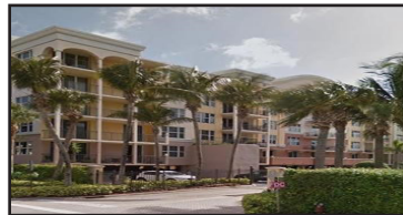
1 OCEAN $459,000.

2 br 2 bth condo in a gated property on Deerfield Island is just steps to the beach and popular shops. Rarely used unit has pristine floors, appliances, and a double balcony. Community is Pet friendly, has a Salt water pool, hot tub, bbq area, gym and clubhouse. MLS F10148349