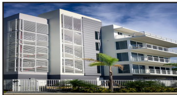
THE ELYSIAN $490,000.

Exceptional opportunity to buy a 2/2 condo in a newly constructed boutique building by the beach. Beautiful kitchen with SS appliances and Italian cabinetry. Full size W/D. Just south of Hillsboro Blvd. in Deerfield Beach between the OCEAN & ICW. MLS F10113080