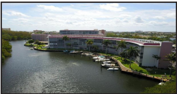
HILLSBORO COVE $419,000.

Rarely available 3/3 is updated, has Beautiful, serene water views, impact windows & doors. Friendly 55+ community has a clubhouse with amenities, is close to shopping, restaurants and everything world famous Deerfield Beach has to offer! MLS F10142628