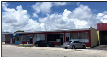
COMMERCIAL PROPERTY $899,000.

Attention investors! This 8,403 sq. ft. building is currently leased to 8 separate tenants and is used as a retail, storage, automotive, industrial and office space. Flexible B-4 zoning provides for a variety of uses. Centrally located in Pompano Beach. MLS F10139396