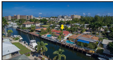
HARBOR VILLAGE $825,000.

A boater's dream, no fixed bridges! Beautifully updated 4br 3bth home on a peaceful cul-de-sac features an open concept living with 80' boat dock, custom kitchen cabinetry, impact windows and doors, cabana bath, pool, 2 car garage. Just minutes to the Hillsboro inlet. MLS F10147913