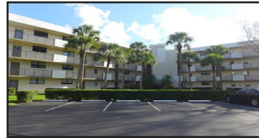
THE PALMS $169,700.

The palms at deer creek! Convenient 1st floor location. Screened porch with golf course view! No membership required! Light & bright with some updating! The palms offer pool, tennis courts and clubhouse. MLS F10142712