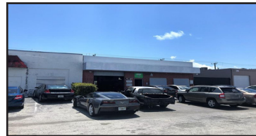
COMMERCIAL PROPERTY $295,000.

Attention Owners & investors! This 2,053 sq. ft. building includes a fenced rear yard and is currently used as an auto repair facility, with 1 bay door, new Twin T concrete roof and HVAC system. Centrally located and close to all major arteries. MLS F10139249