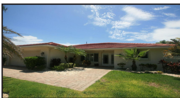
SPANISH RIVER LAND CO. $949,000.

With over 2,000 sq. ft., this spacious home has been recently renovated with premium materials. Marble floors, impact windows, remodeled baths, gourmet kitchen, new salt-water pool. In Spanish River Land Co just steps to the beach! MLS R10457007