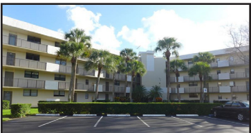
THE PALMS $169,700.

The Palms at Deer Creek! Convenient 1st floor location. Screened porch with golf course view! No membership required! Light & bright with some updating! The palms offer pool, tennis courts and clubhouse. MLS F10142712