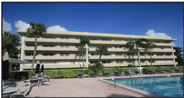
ATLANTIC CLOISTERS $519,000.

Enjoy ocean views from your full-length balcony in this rare renovated condo. Spacious, bright 2Br, 2 bath corner condo features an open kitchen, Quartz counters, large bedrooms, updated bathrooms, Impact windows. Complex offers heated pool, clubhouse, and green space. MLS R10485723