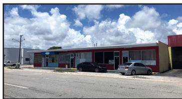
COMMERCIAL PROPERTY $899,000.

Attention investors! This 8,403 sq. ft. building is currently leased to 8 separate tenants and is used as a retail, storage, automotive, industrial and office space. Flexible B-4 zoning provides for a variety of uses. Centrally located in Pompano Beach. MLS F10139396