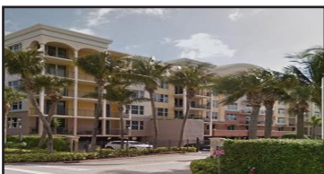
1 OCEAN Just Reduced to $445,000.

2 br 2 bth condo in a gated property on Deerfield Island is just steps to the beach and popular shops. Rarely used unit has pristine floors, appliances, and a double balcony. Community is Pet friendly, has a Salt water pool, hot tub, bbq area, gym and clubhouse. MLS F10148349