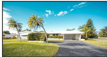
THE COVE $439,000.

Wow! 9500+sq ft corner lot with 3 bedrooms, 2 baths feature kitchen cabinets, countertops, appliances, AC, water heater, washer/dryer and refinished terrazzo floors all only 4 years old. Huge walk in closets, ample storage, tons of natural light throughout. MLS F10154276