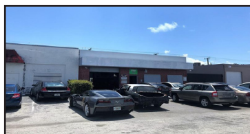
COMMERCIAL PROPERTY $295,000.

Attention Owners & investors! This 2,053 sq. ft. building includes a fenced rear yard and is currently used as an auto repair facility, with 1 bay door, new Twin T concrete roof and HVAC system. Centrally located and close to all major arteries. MLS F10139249