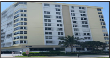
OCEAN HARBOR $460,000.

Desirable 2/2 condo in a secure, well maintained building in Deerfield Beach with lots of amenities! Move-in condition but ready for updating. Bright corner location with extra windows. City and ocean views from balcony. Private beach access. MLS F10126264