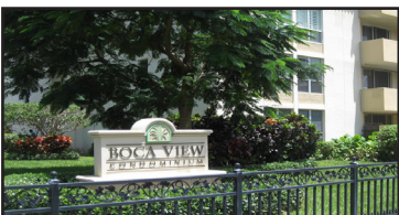
BOCA VIEW $285,000.

Enjoy beautiful Boca Raton year round in this resort style building just a short walk to the beach, local shops and restaurants. This spacious 2 bedroom/2 bathroom condo boasts 2 walk-in closets, open concept kitchen and pool view from the private balcony. MLS R10480876