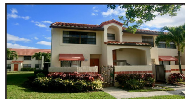
INDEPENDENCE BAY $195,000.

This 2nd floor large corner unit 2/2 allows for privacy, more sq. footage and extra windows making it light and bright. Bonus room off family room can be used for den/office. Unique open kitchen, Attic has extra storage. Large screened balcony overlooks lush green space. MLS F10154404