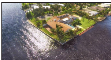
THE COVE $1,450,000.

Rarely available size property of over 19,500SF Point Lot in The Cove. Spacious 6 bedroom 6 bath home at the end of a quiet cul-de-sac features two master suites, 3 car garage, pool with patio. A premier location with 280' of water frontage. MLS F10148686