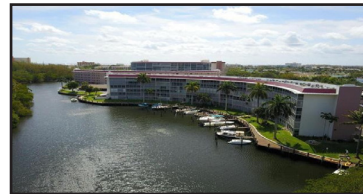
HILLSBORO COVE $419,000.

Rarely available 3/3 is updated, has Beautiful, serene water views, impact windows & doors. Friendly 55+ community has a clubhouse with amenities, is close to shopping, restaurants and everything world famous Deerfield Beach has to offer! MLS F10142628