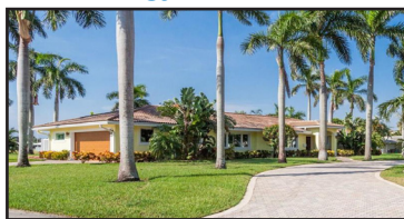
LITTLE HARBOR $1,189,650.

This 4 Bedroom 3 bath home with 2 car garage has been totally renovated with top of the line appliances, fixtures & finishes. Backyard has a resort style pool, covered patio & outdoor kitchen. All newer plumbing & electrical. Close to beach, restaurants, and shops. MLS R10474139