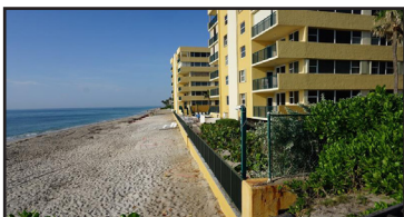
PORT DE MER Just Reduced to $289,000.

Enjoy Deerfield City Lights at night and Intracoastal and ocean view from the patio of this 2br 2 bth corner unit condo. Features hurricane windows, Washer /Dryer in unit, Remodeled shower, 2 great size walk in closets, garage parking spot, 2 pools. MLS F10133687