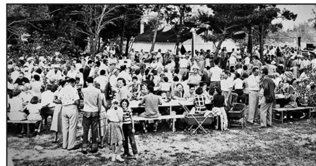
Pioneer Days (then called Cracker Day) began in 1947.

1947 marked the formation of one of Deerfield's most influential civic organizations, The Lions Club. Its first project was establishing Pioneer Park along the banks of the Hillsboro Canal. The Lions cleared the scrub growth and fashioned a picnic area and baseball diamond complete with stands and barbeque pits. The park has been expanded